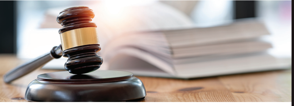
* Information provided by advertisers as of 4/1/24

MSU specializes in representing condominiums & homeowners' associations throughout Massachusetts, New Hampshire, and Rhode Island. MSU provides a full range of legal services including non-payment/ lien enforcement; litigation; developer transition issues; drafting of condominium documents, amendments, and rules; legal enforcement of rules; contract review and negotiation; general Board assistance, etc.